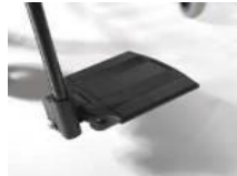
Divided footplate aluminum