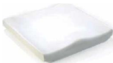
Jay Basic (picture shown without upholstery)