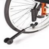
Anti-tip swing away