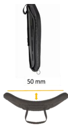
JAY J3 Back Shallow Contour