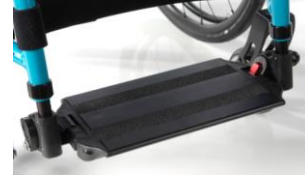
Platform, angle and depth adjustable; flip up, aluminium with locking system