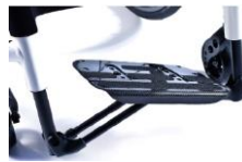
Footboard platform, lightweight, carbon fibre, auto folding