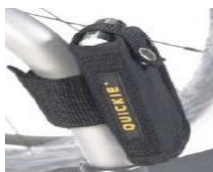
XES090026 Mobile phone pocket