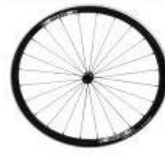
XES07000 Proton wheel