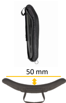
JAY J3 Shallow Contour