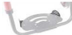
XES050127 Adjustable side protection