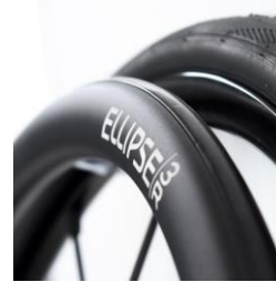
XES070212 Handrims Ellipse 3R