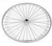
XES070002 Design wheel