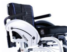
XES040117 Tubular armrest, swing away, removable, padded