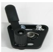
XES060001 Standard brake