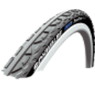
XES070107 Schwalbe One