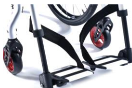
XES050022 Footboard divided, aluminium, frame colour