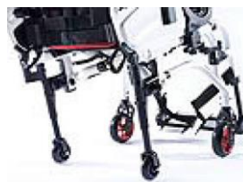
XES090010 Transit wheels