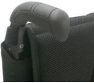
XES 030201 Push handles long