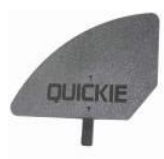
XES040107 Composite sideguard detachable