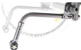
XES090050 Anti-tip tubes, plug in, pair