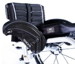
XES040104 Carbon fibre, cold weather protection, fender