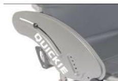
XES040102 Aluminium, cold weather protection