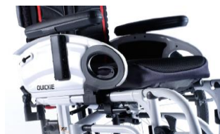
XES04000x Desk sideguard, armpad, flip- up, removable