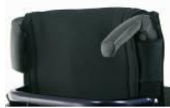
XES 030203 Push handles, fold-down