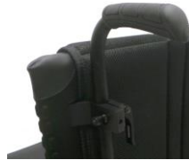
XES 030204 Push handles, height-adjustable