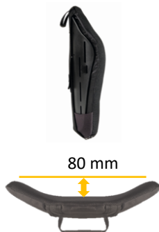
JAY J3 Mid Contour