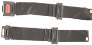
XES 090018 Lap belt with buckle, metal