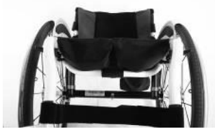
XES 020003 Seat sling with utility bags 2