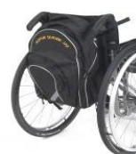
XES090030 Back pack