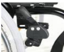
XES060002 Knee lever brake