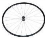
XES070003 Lightweight wheel