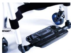
XES050132 Footboard platform, lightweight, carbon fibre