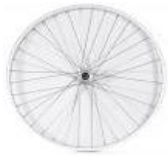
XES070001 Universal wheel