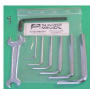
XES090000 Tool kit