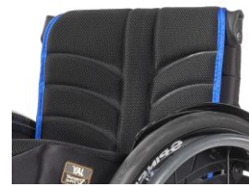
XES 030317 EXO PRO backrest sling (EXO Evo version)