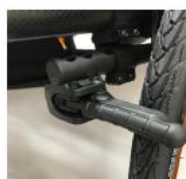
XES060023 Compact brake EVO