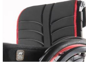
XES 030316 EXO backrest sling (EXO Evo version)