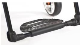
XES050059 Footboard platform, Performance