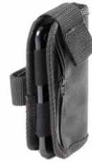
Mobile phone pocket