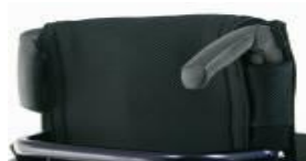
Fold down push