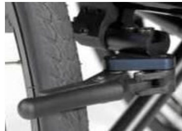
Compact wheel lock