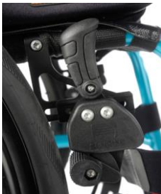
Knee lever wheel lock