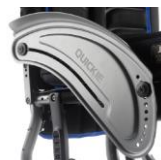
Sideguard alu with fender