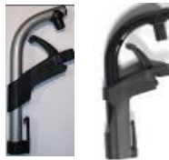
Hanger Angle 70°/80°