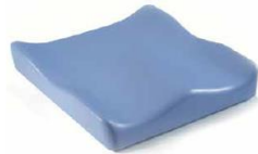
Jay Soft Combi P (picture shown without upholstery)