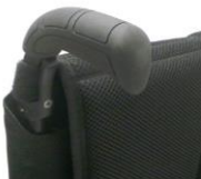
Push handles long