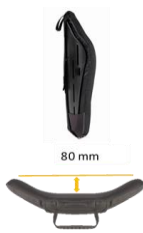
JAY J3 Back Mid Contour