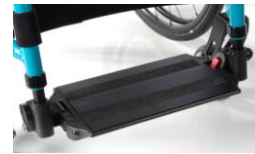
Platform, angle and depth adjustable; flip up, aluminium with locking system