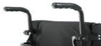
Height adjustable push handles