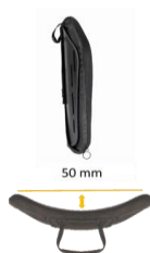
JAY J3 Back Shallow Contour