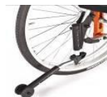
Anti-tip swing away