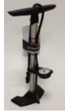
High pressure pump