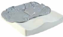
Jay Easy Fluid (picture shown without upholstery)