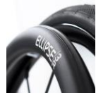
Ellipse 3R Handrim