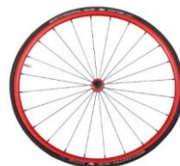
Lightweight wheel, anodized red