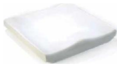
Jay Basic (picture shown without upholstery)