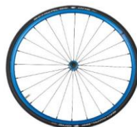
Lightweight wheel, anodized blue