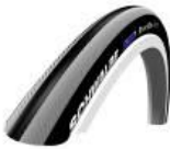
Right Run Tyre