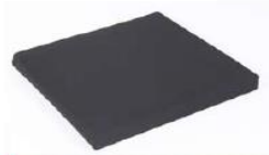
Seat cushion, cover with zipper, black