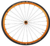
Lightweight wheel, anodized orange