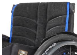
EXO PRO backrest sling (new EXO Evo version)