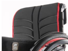
EXO backrest sling (new EXO Evo version)