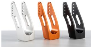
Fork Aluminium, black, orange & silver