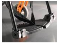
Divided footplate composite