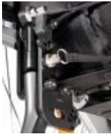
Backrest, angle-adjustable, lock when folded