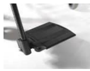
Divided footplate aluminum