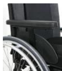
Single-post sideguard, depth adjustable, tool height-adjustable